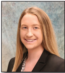
Riley Duckworth Foundation Associate Director